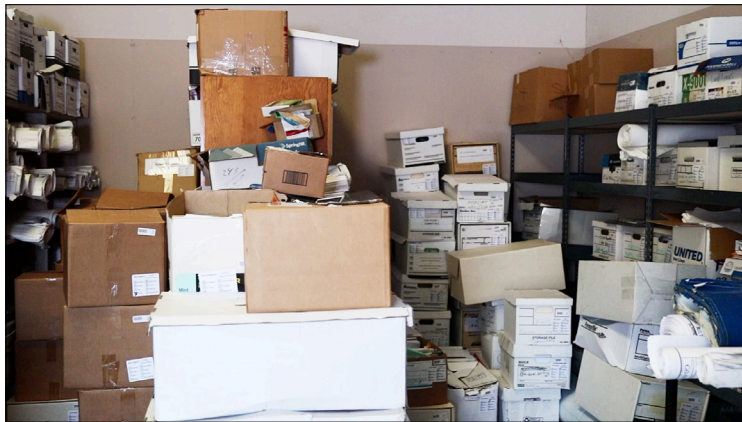
The plan room at the Facilities Office contained hundreds of boxes and binders of building-related documentation